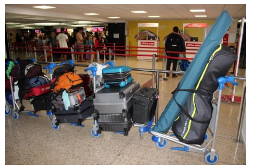
An overview of luggage Tahiti