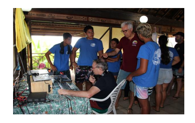
Open day with students from the island's 2 colleges