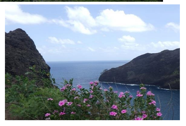
Fenua Enata, History in pictures