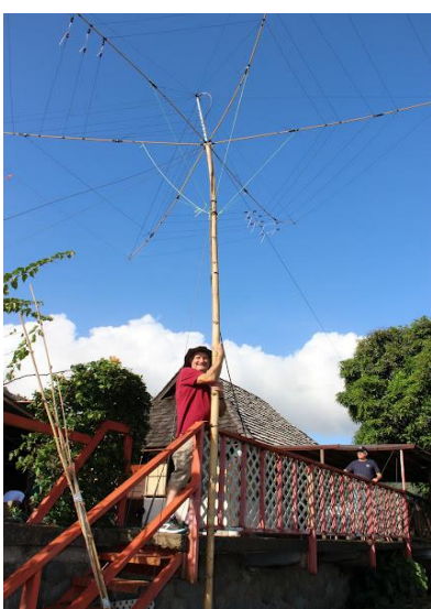
The Quad was complicated to install because of the vegetation.