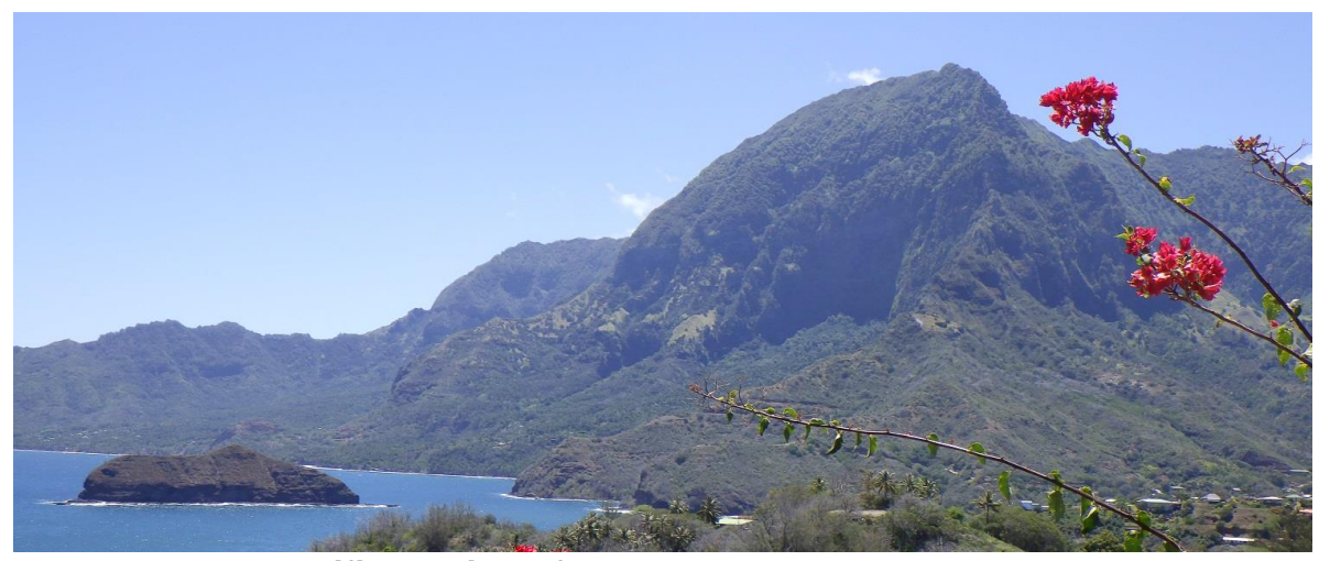
magnificent views from the KANAHAU guesthouse