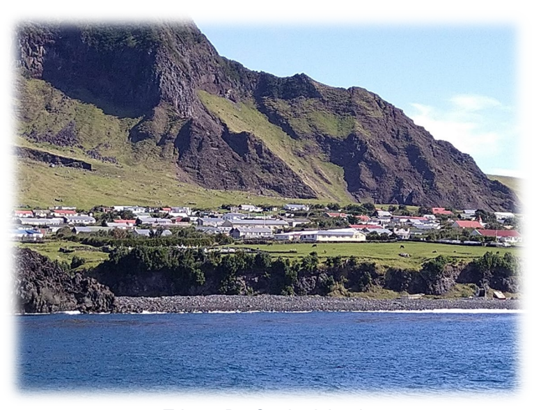
Tristan Da Cunha Island