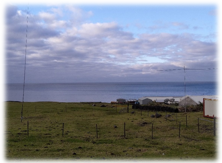
Antennas and the free horizon

Tuesday morning, I went to tourism administration and talked about finding different location for me because this one was not suited for my activities. I asked for a place somewhere in town outskirts so there would be place for setting up antennas. Some of the guest houses were going to be vacated only on 15<sup>th</sup> of October when the next ship departures. In the end, we