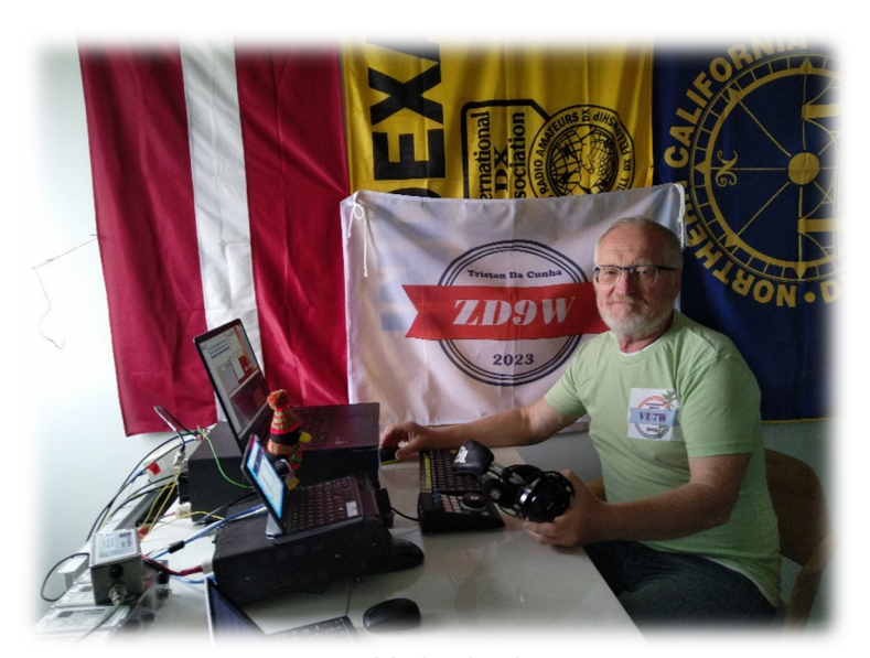
Me in shack