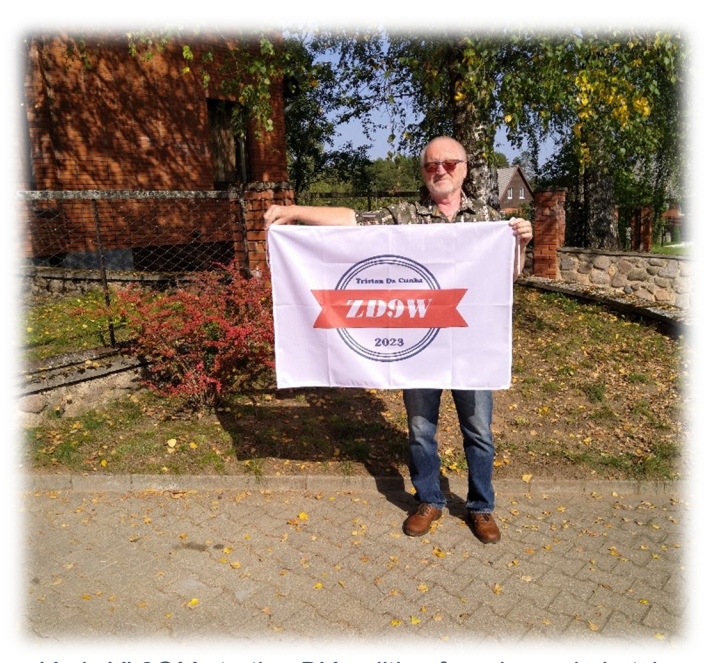
Yuris YL2GM starting DXpedition from home in Latvia

After this came covid and the island was closed down for all visitors. All restrictions were lifted only in spring 2023 and immediately I started to communicate with the island administration. Opportunity came up, however, this time I decided to go alone because the chances to get berths for more operators were lower. I was offered a berth on a cargo ship "Lance" leaving Cape Town on 15<sup>th</sup> of September 2023. The return was planned with fishing vessel "Edinburg" on 24<sup>th</sup> of October 2023.