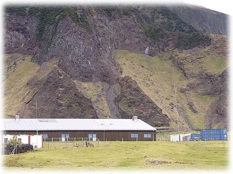
Antennas and the mountain behind, station bottom-left