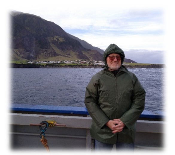
Waiting to disembark

The voyage continues and the initial plan to reach Tristan Da Cunha Island is one week later on 22<sup>nd</sup> of September. However, captain informs us that the weather conditions will be getting worse and in best case scenario we will reach our destination only by 26<sup>th</sup> of September. Also, this heavily depends from local weather on the island whether we will be able to disembark.