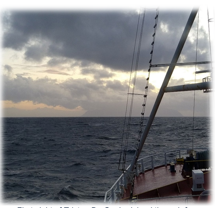
First sight of Tristan Da Cunha Island through fog

Internet on the ship is very limited only available every second day for one hour only for text messaging. No picture and video transfer possible. However, this is enough to inform our families that we are safe.