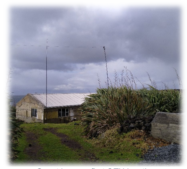
Guest house - first QTH location

During the night weather conditions are getting worse and when the morning comes, I see that my vertical has