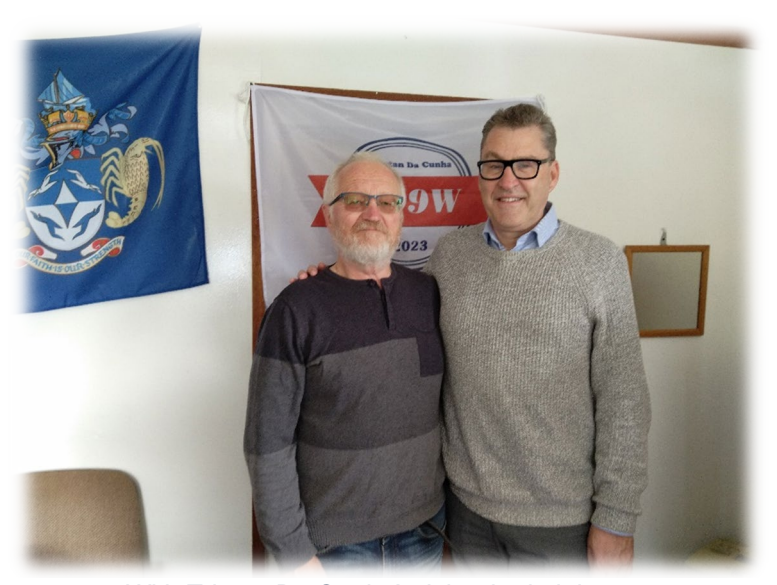
With Tristan Da Cunha's Island administrator

Expedition website: https://lral.lv/zd9w/