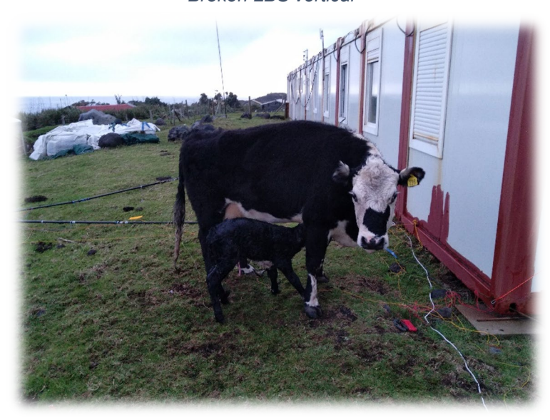
Cows tangled in the Spiderbeam wires

work EU and JA on 80m telegraph. I was planning to do the same on low bands for the following night as well, however, the weather had different plans and the winds just got stronger. This continued for a week and during these days I lowered and fixed LBS vertical three times and similar situation was with Spiderbeam also. The 6m Yagi was beyond repairs.