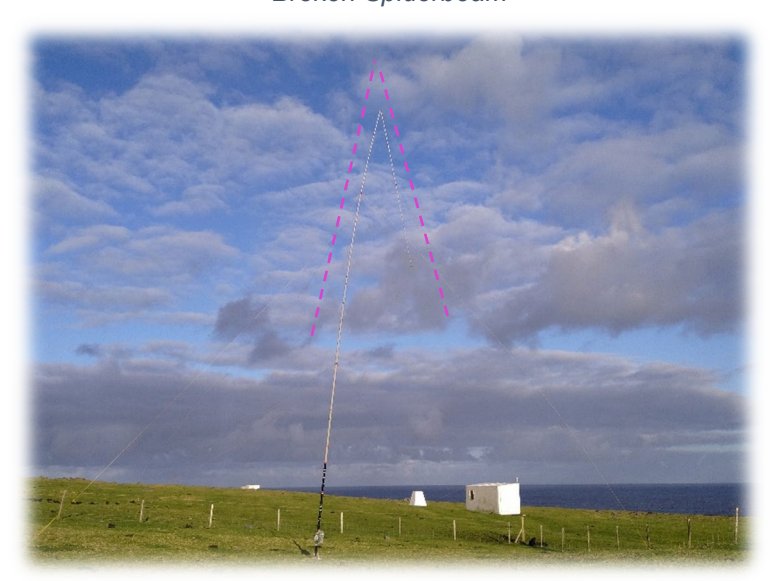
Broken LBS vertical