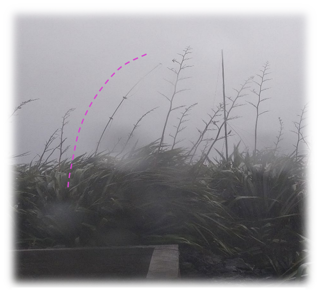
Vertical bending in the strong winds

found different solution and arranged a room in the kindergarten building. Kindergarten works 5 days a week from morning till 3pm, with 3 baby sitters and 5 kids. With place for antennas and free horizon to main directions for US, EU and JA this place was ideal. For lunch and dinner every day I still went to the guesthouse where the meals were prepared by the hosts.